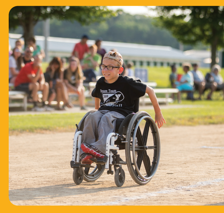
Dream Team T-Ball at the Caylor-Nickel Foundation Family YMCA gives those with all abilities the opportunity to participate and have fun.